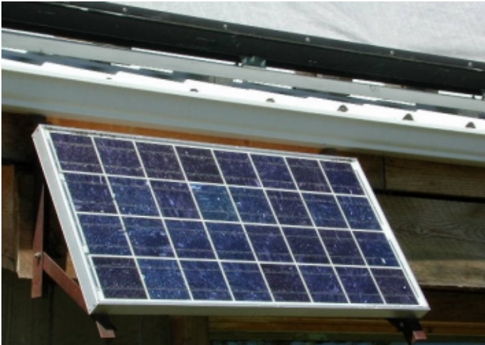
Photovoltaic arrays are becoming popular with rural and urban homeowners who want to avoid monthly power bills.

other electricity may be needed during the night. In some cases, the panels make more electricity than is needed in the building, and the excess is sold to the power company. This results in the power company sending the building owner a cheque instead of a bill!