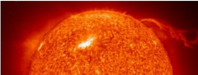
The sun emits unimaginable amounts of energy into space every day, mostly in the form of visible light.

On planet Earth, sunlight is an incredibly important form of energy. Every day, the sun pours unimaginable amounts of energy into space. Some of it is in the form of infrared and ultraviolet light, but most of it is in the form of visible light. Some of this energy falls on the Earth, where it warms our planet's surface, drives ocean currents, rivers, and winds, and is used by plants to make food. Life on Earth depends totally on the sun.