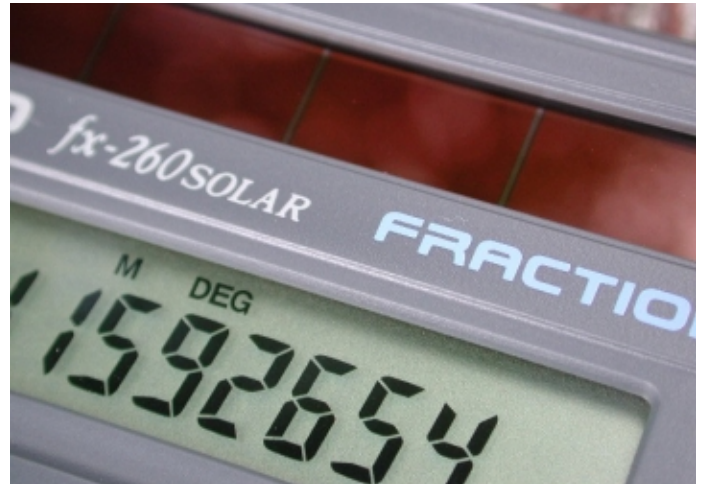
This calculator is powered by a single photovoltaic cell.

A single cell can produce only very tiny amounts of electricity—barely enough to light up a small light bulb or power a calculator. Nonetheless, single photovoltaic cells are used in many small electronic appliances such as watches and calculators.