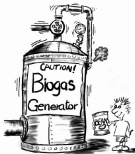
Two common sources of biogas. Dave Mussell

accumulate. Biogas consists mostly of a gas called methane, which is the same as “natural gas”, commonly burned in our furnaces and barbecues. Biogas can be used instead of natural gas for heating and cooking.