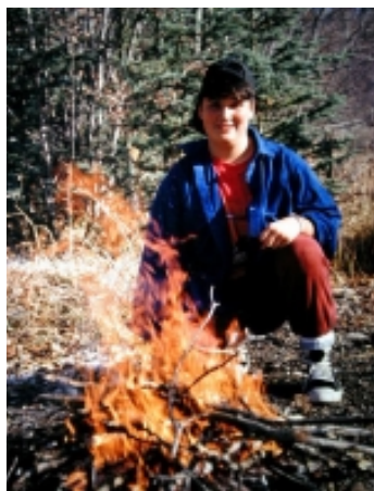
Wood is a source of renewable energy.

B ioenergy is energy stored in materials made with the help of living things. An everyday example of bioenergy is wood heat. Wood is produced by growing trees, and contains highly flammable substances. Wood heat is probably humanity's oldest energy source. Other sources of bioenergy include alcohol and biogas. Alcohol is a flammable liquid made by certain yeasts, and biogas is