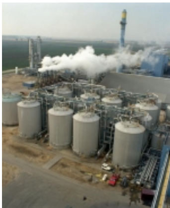
Ethanol and methanol can be made from plant materials such as corn, at refineries like this one.

Both ethanol and methanol make excellent fuels for cars and trucks. In fact, ethanol is used in the engines of Formula 1 racing cars. It burns very cleanly, and delivers more power than gasoline. Many service stations now sell fuels that contain a blend of gasoline and an alcohol, usually ethanol.