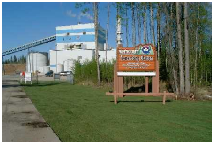
This generating station in Canada burns biomass fuel from nearby sawmills to produce energy.

from sugars, which they make during photosynthesis. Because cellulose is made from sugar, it contains a lot of stored chemical energy, energy that originally came from the sun. This chemical energy can be released as heat when wood is burned.