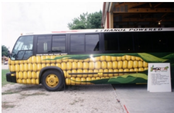
This bus uses ethanol instead of gasoline as a fuel.